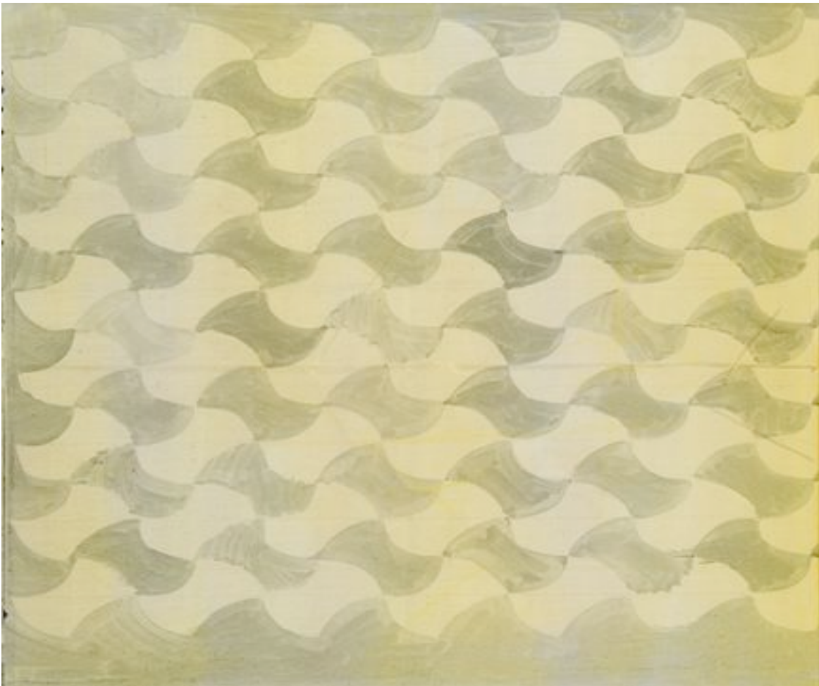
Walter S. Eleveld (2008) oil on canvas, 34 x 42"

For a while I've been making paintings based on found textiles: raw fabrics, printed towels, sweaters, shirts, skirts, rugs, quilts. Sometimes I want to represent the shape of the object—sleeves, pockets, folds—and other times I just lift the pattern. In all cases I try to replicate the object's design faithfully, while at the same time adapting it to the way I paint. There's an economic principle at work in textiles that I try to follow as a painter: to try to get the greatest effect with the simplest elements. The interesting thing for me about textile, and patterning in general, is the way in which decorative motifs are constantly, endlessly reappropriated, and change in unexpected ways with each particular use.