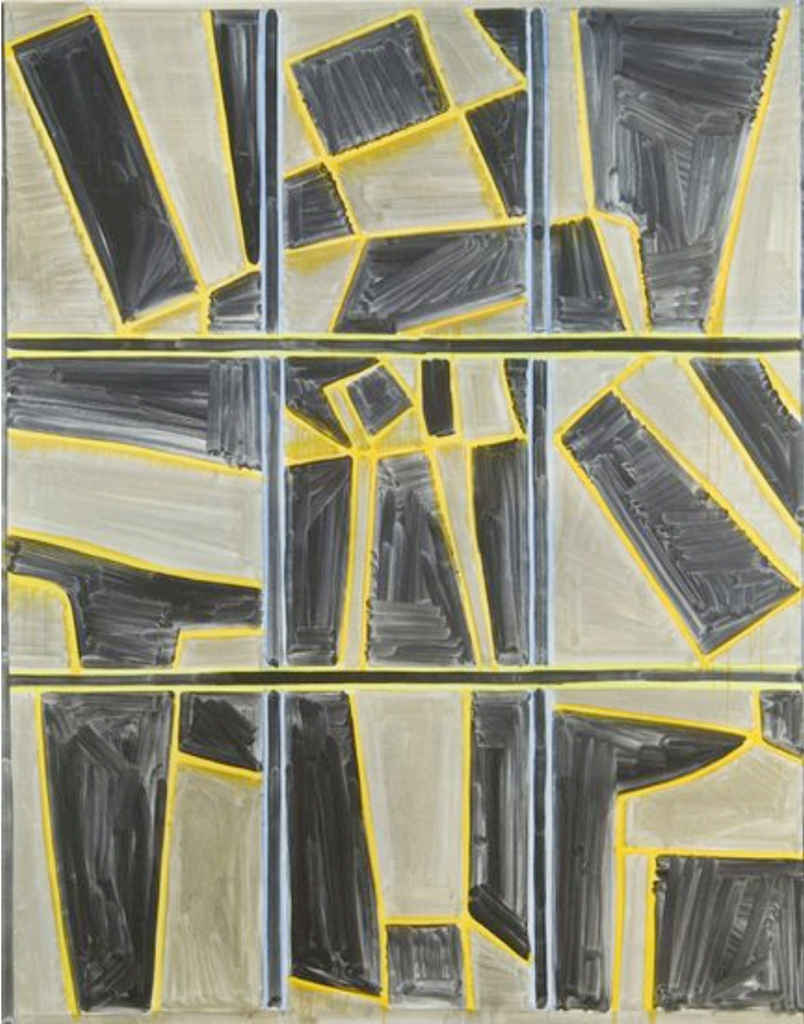
Free Copy (2008) oil on canvas, 62 x 50"