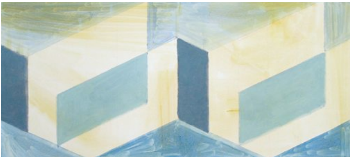
Albers (2007) oil on canvas, 12 x 24"