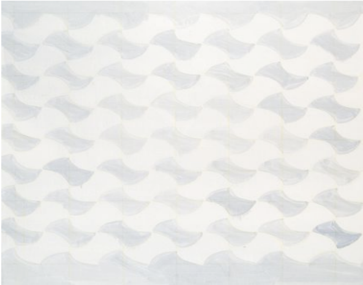
The Villager (2007) oil on canvas, 44 x 54"